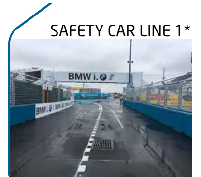
SAFETY CAR ARROW MARSHAL

*Pit exit lights will turn red when the Safety car reaches this point