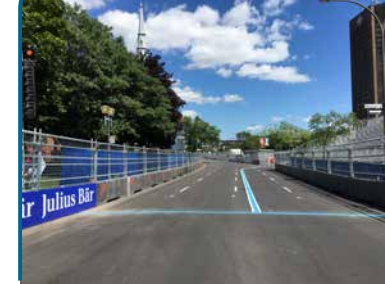
SAFETY CAR LINE 2

*Pit exit lights will turn red when the Safety car reaches this point