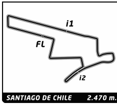
ABB FIA Formula E Championship Round 4 - Santiago ePrix Non Qualifying Practice 2