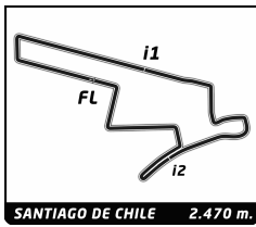
ABB FIA Formula E Championship Round 4 - Santiago ePrix Non Qualifying Practice 2