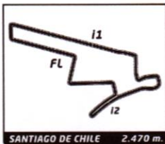
ABB FIA Formula E Championship Round 4 - Santiago ePrix Non Qualifying Practice 1